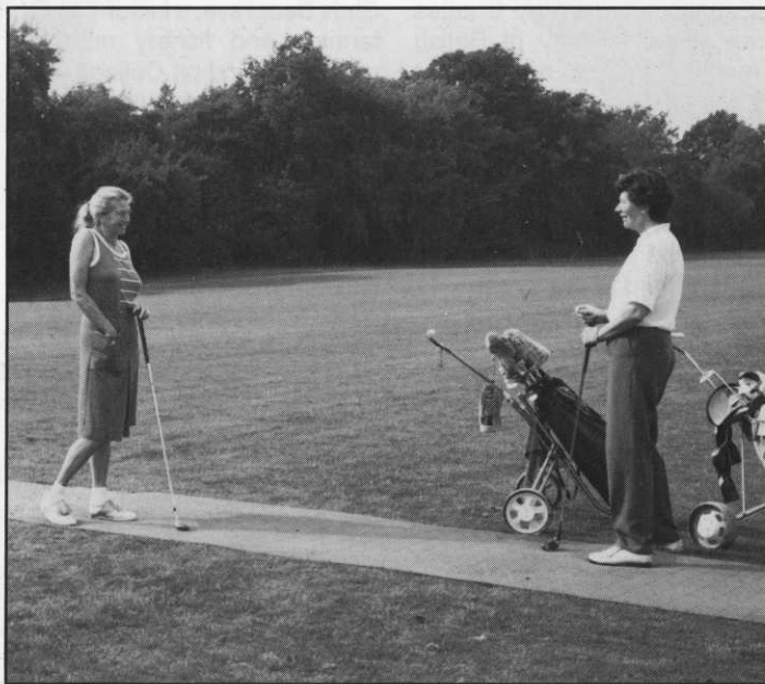
'Tee-path', an artificial surface for use on walkways to tees.

P.N. Structures, who extended their expertise in the field of outdoor sports surfaces into golf by becoming the first company to provide a new club with all synthetic greens, is offering a special price on the Neolast Golf Mat