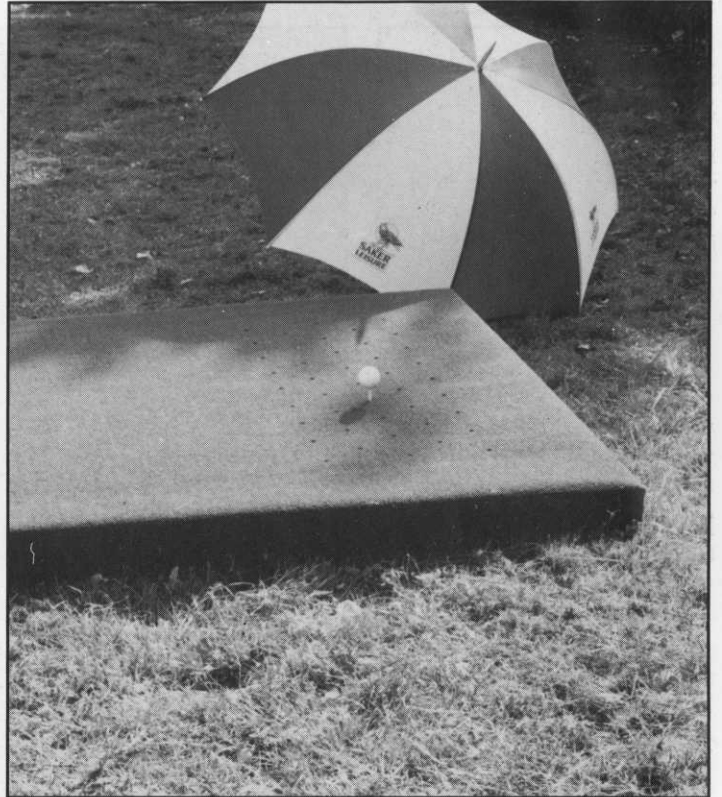
Saker Leisure supply the 'Mastertee'

Fibre manufacturers, F Drake (Fibres) are part of the Readicut International Group plc and are Britain's leading polypropylene fibre manufacturer.