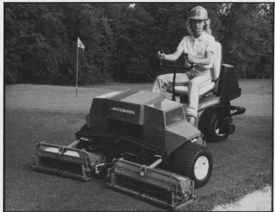
Jacobsen's Tri-King 1671D

This will not affect customers as the depots and distribution network will continue to operate under regional management. Board