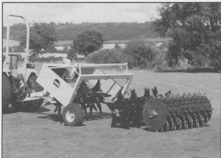
The new McConnel Dabro Interchangeable Ground Support System, consists of an Outfield Slitter, Green Slitter and Corer. All the implements slip easily in and out of the common frame.

The takeover by F. W. McConnel of Dabro International announced a few days before the start of the Exhibition brings together two companies likely to have consid-