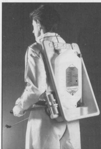
The Transformer Sprayer is lightweight and very easy to use.

The award for the best new product, went to Ciba-Geigy for their Transformer Spraying System. A remarkable achievement as the British