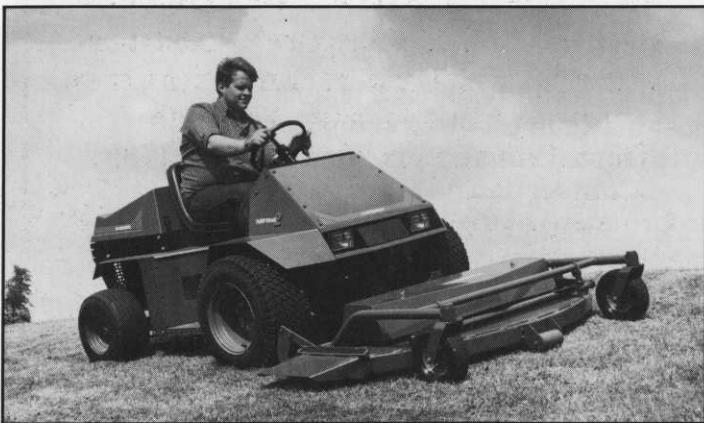
Ransomes new 16.5hp Kubota diesel engined TURFTRAK 2 power unit pictured at work with a front mounted rotary mower. The TURFTRAK 2 has an adjustable traction booster for transferring weight from the attachment.

The smallest of the range, the 19 horsepower TU 318, utilizes a new Iseki power-