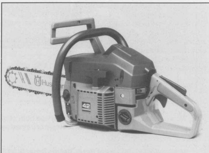
The new Husqvarna 42 chain saw. Features a powerful 42cc engine, inertia activated chain break, chain catcher, rear hand guard, and a safety throttle lock. Competitively priced at £245.00 + VAT (13" bar).

With this renewed interest in the mechanical saw, Husqvarna, part of the Elec-