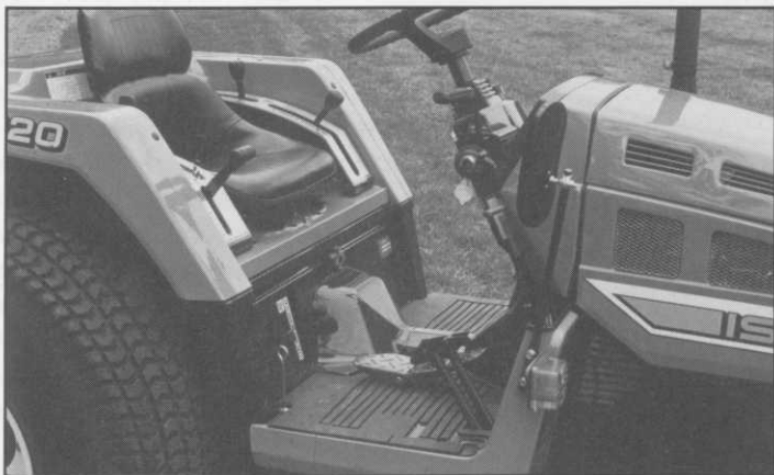
A stepthru deck of the Iseki TU Tractor gives the driver a much more relaxed place to operate.

Visitors to the stand could also see a video of the St. Pierre Tournament final. Exposure to the camera can be quite traumatic as some competitors discovered when they saw their golf swing.