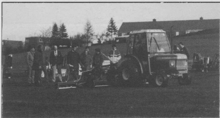
One of the Brouwer range of trailed gang mowers.

The Brouwer range of turf-care machinery has a first-rate reputation for quality and reliability and the latest tractor mount reel mower is loaded with exciting new features and options. Golf Course models are available, delivering a fine cut.