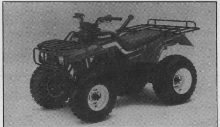
Readily identified by the twin headlamps mounted below the front carrying rack, the Kawasaki KLF220 is a very sophisticated machine available at the value for money price of £1,899 plus VAT.

Over the last few months, Kawasaki have been embarrassed by their KLF185 ATV – or rather by their lack of stock. For this well-proven work-horse has proved such excellent value for money that they had completely sold out, while still waiting for the replacement model.