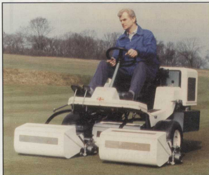
The Huxley Three 58 Greensmower

The Three 58 has hydrostatic drive with separate pedals for forward and reverse, stopping by easing off the drive pedal. Cutting speed is around 3 mph at 180 cuts per yard, with a top travelling speed between greens of 8.5 mph.