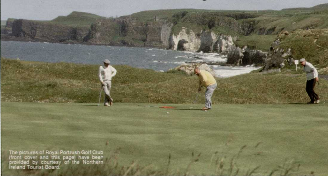
The pictures of Royal Portrush Golf Club (front cover and this page) have been provided by courtesy of the Northern Ireland Tourist Board.

Watermation FOR ALL SPORTS TURF IRRIGATION