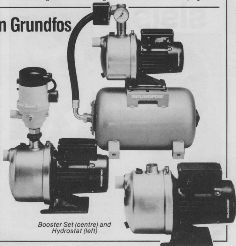
Booster Set (centre) and Hydrostat (left)