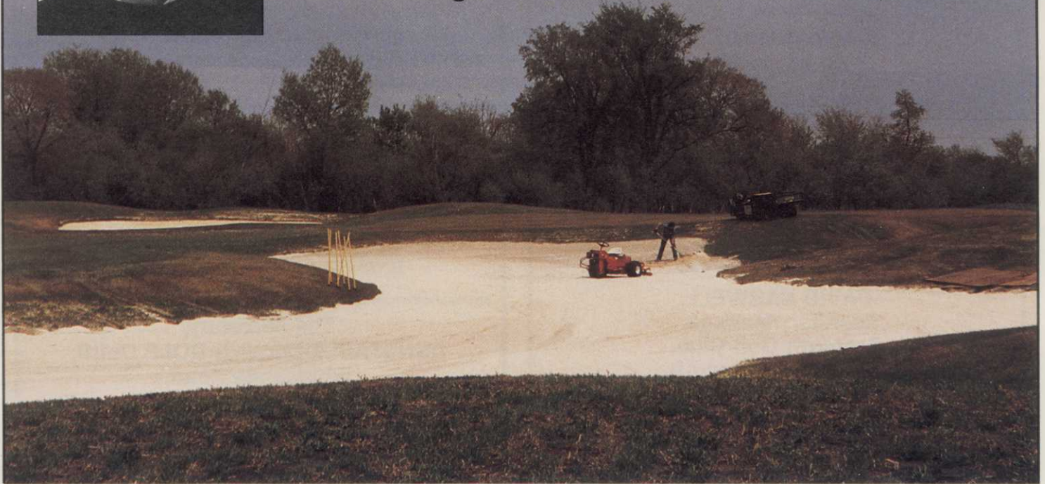
One quarter of the large Bunker at Edinburgh, U.S.A. (Typical of a Trent Jones design)