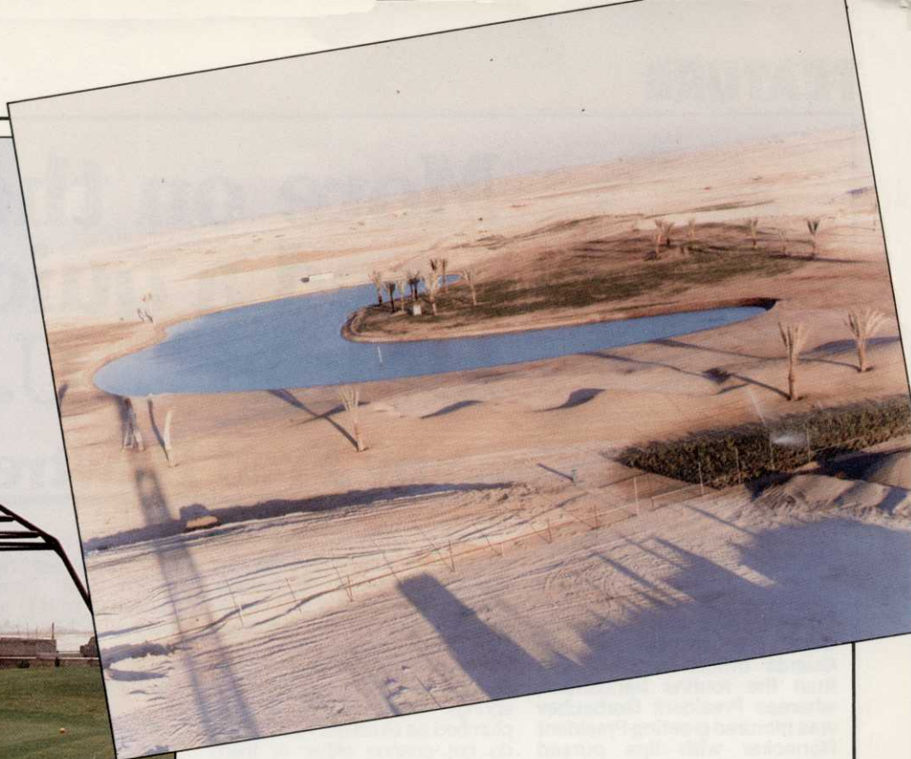
(Above) A man-made oasis sprouts from the desert sands.