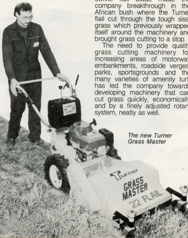
The new Turner Grass Master

The need to provide quality grass cutting machinery for increasing areas of motorway embankments, roadside verges, parks, sportsgrounds and the many varieties of amenity turf, has led the company towards developing machinery that can cut grass quickly, economically and by a finely adjusted rotary system, neatly as well.