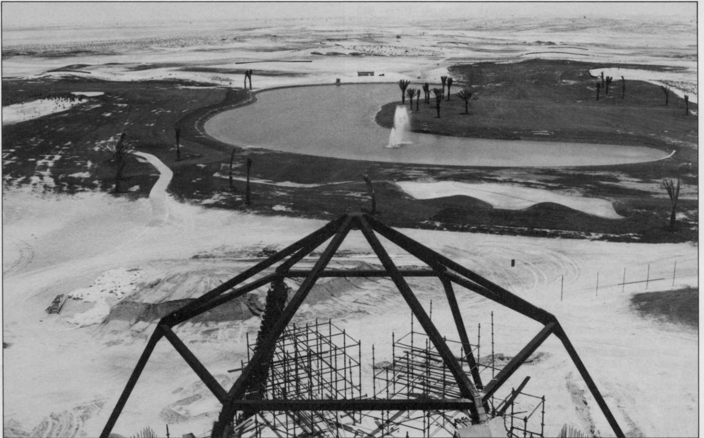
One of four lakes stocked with Japanese Carp in front of the club-house.