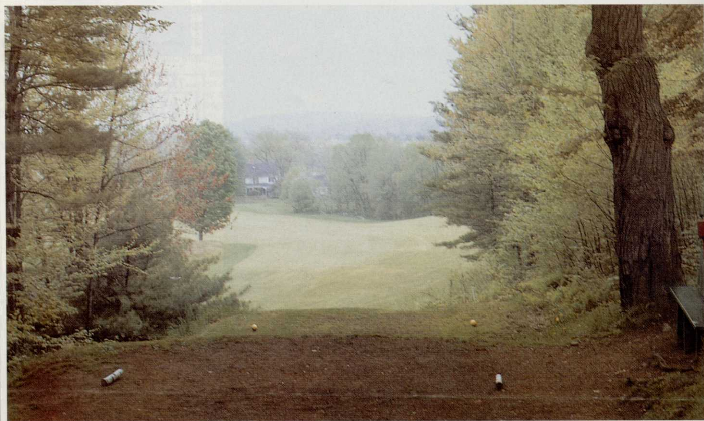
A small tee before and after trees were removed.

Finally, the growing environment around many tees has changed over