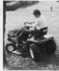
Rotary mower attachment by Kubota