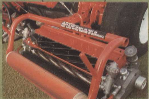
TORO Groomer Reels can be fitted to most GREENSMASTERS