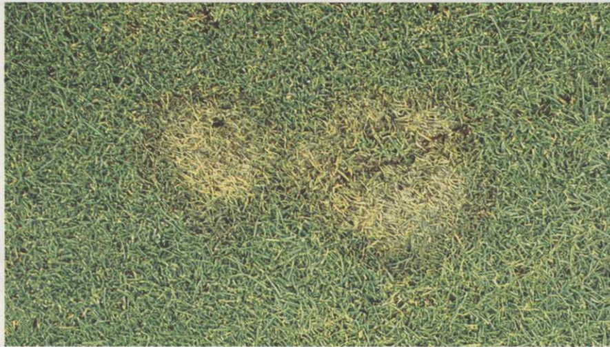
Figure 2: Typical fusarium patch scar