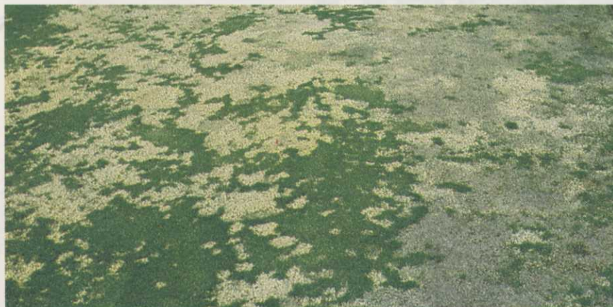
Figure 4: Extensive damage caused by pink snow mould

Integrated disease control is the complementary use of biological, cultural and chemical control methods to achieve the most effective and economical disease control possible.