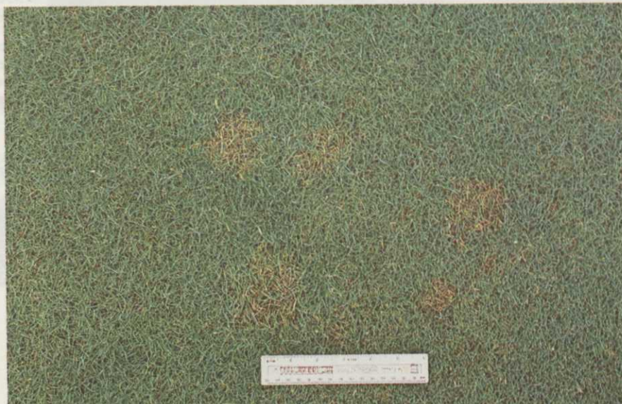
Figure 1: Early symptoms of fusarium patch disease

If steps are taken to reduce or even eliminate the factors that favour disease development, then the cycle can be slowed down or even stopped. This can be achieved through an integrated disease control programme.