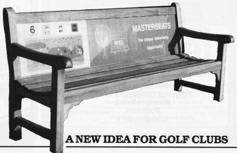
A NEW IDEA FOR GOLF CLUBS

The Weather-matic division of Texas Industries is based in Dallas, Texas and manufactures a complete line of irrigation controllers, valves and sprinklers.