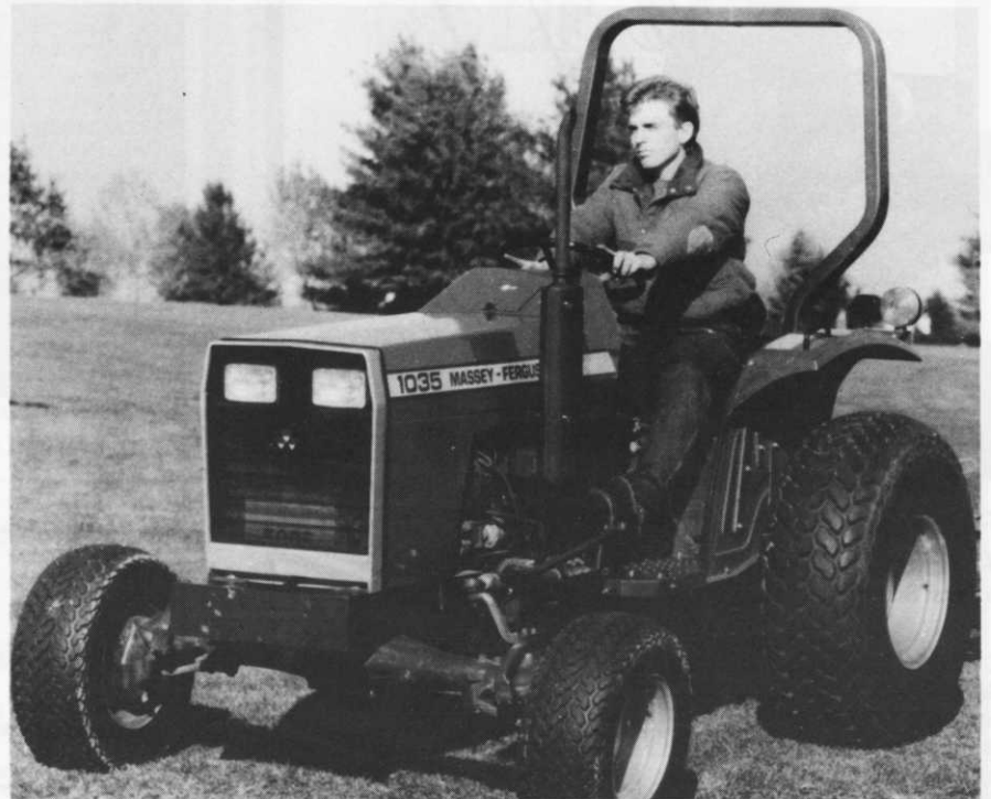
Moving up the power range in compact tractors - this new 31hp M-F 1035 extends Massey-Ferguson's compact tractor line-up to six machines.

Comfortable cabs ensure they can be used all-year round, and there is an extensive choice of tyres to suit all needs.