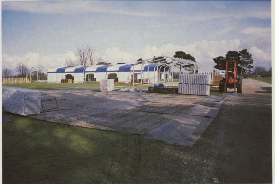
Above: TENTED VILLIAGE SITE