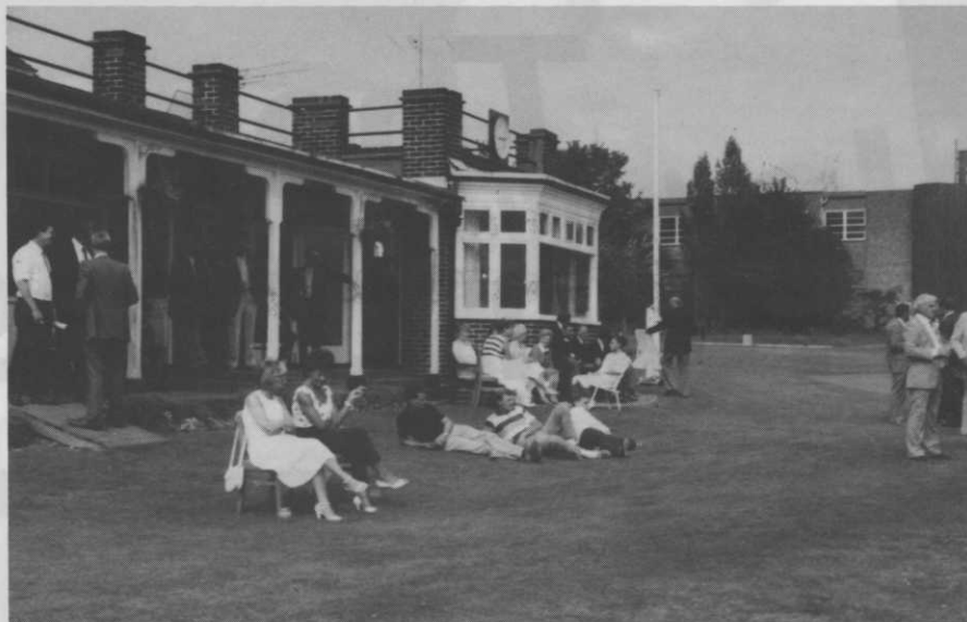
Some of the competitors and their wives enjoying the sunshine in front of Verulam's clubhouse.

THIS year's BIGGA annual tournament was held at Verulam Golf Club, St. Albans, Hertfordshire, and was a resounding success.