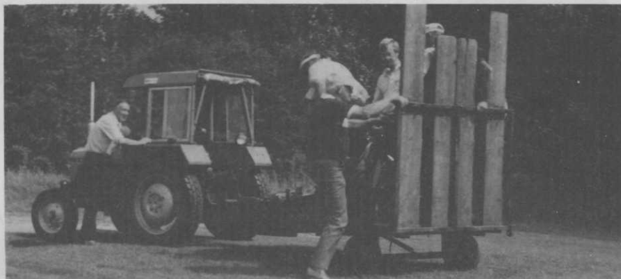
Transport was laid on!