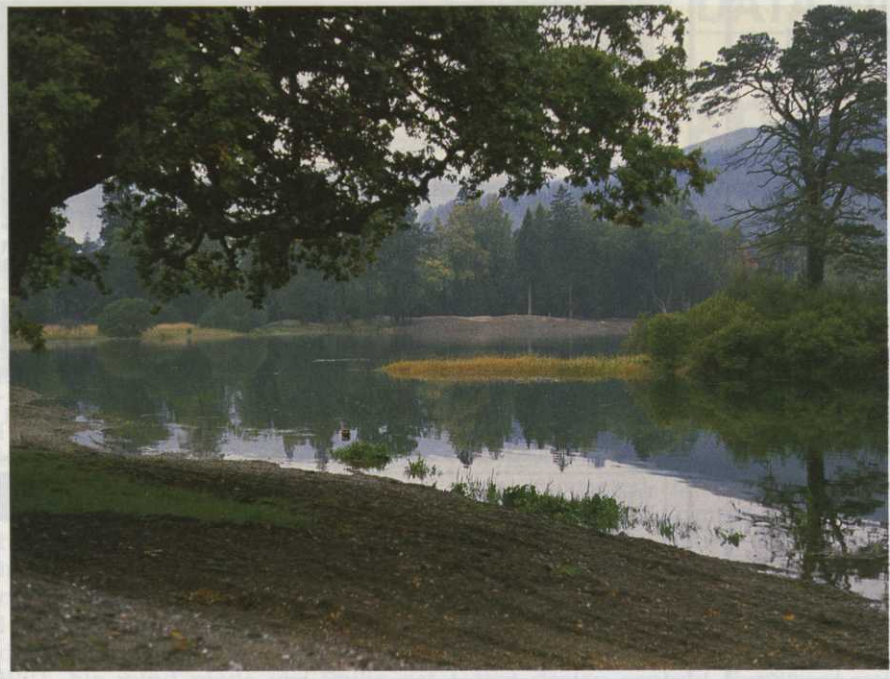
Looking over an inlet of the Loch towards the 17th green