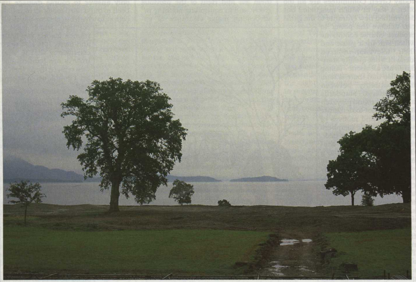
Looking out across Loch Lomond from Rossdhu House, the stately home, later to become the club-house