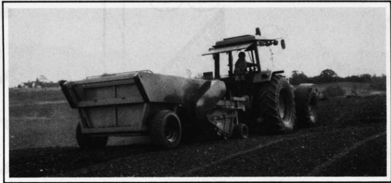
New Squier 40 Land Clearer/Beach Cleaner

West Hove's lease from Wimpneys runs out in January next year and a month