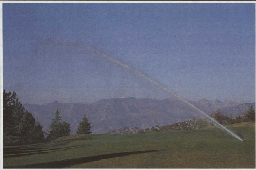
Reaching for the sky. A Toro 690 in action against a rugged backdrop looking towards Chateauneuf

"In real terms and with some eighteen months experience of the Network 8000 under his belt, Mike claims that he is now able to use limited water resources to maximum effect. I calculate that I am saving 25% of water at my disposal yet getting 50% more effective coverage because of the system."