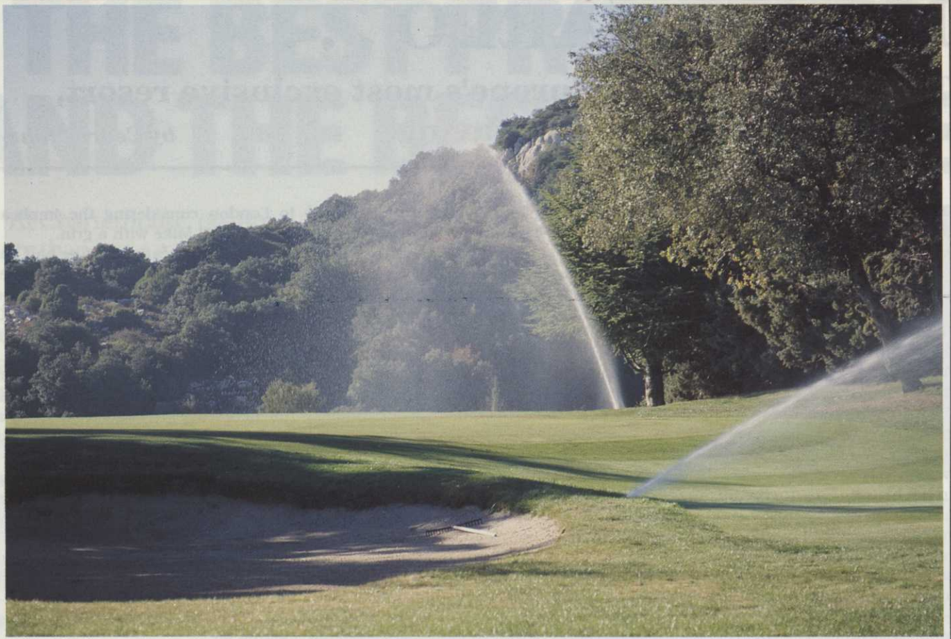
Sylvan setting. The tree lined approaches to the par 3 14th hole at Monte Carlo

"The existing system was nothing more than a hotch-potch of Rainbird Weathermatic, Perrott and Toro sprinklers and equipment - 1988 was to be the year of the irrigation system."