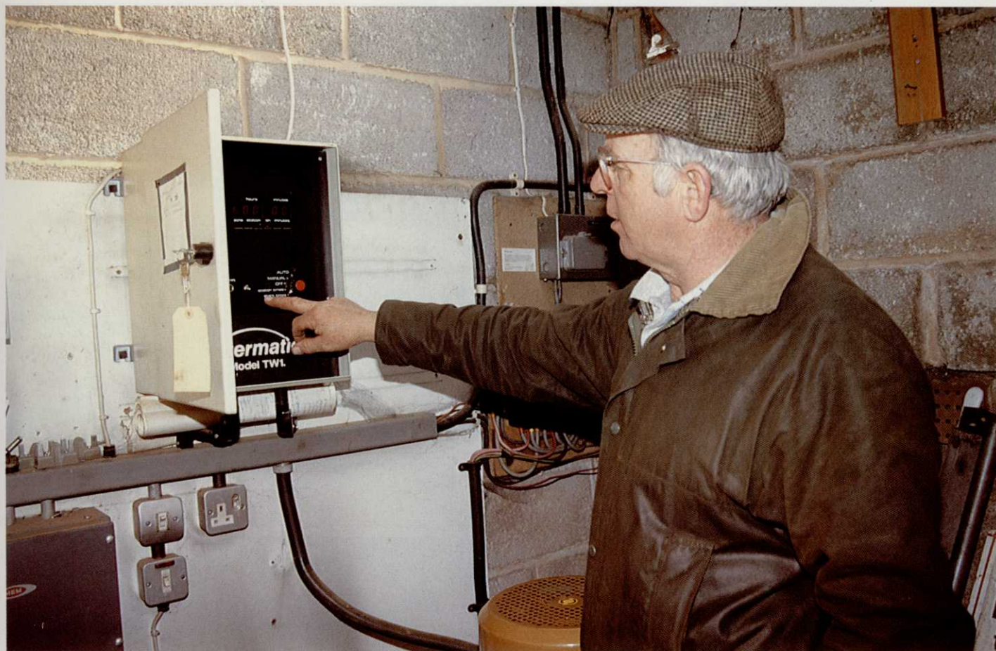
Setting the programme on the Watermation irrigation system.

southern shores of Torbay and, apart from the first and 18th holes, clings tightly to the coastline with the back nine played virtually straight into the prevailing south-westerly winds.