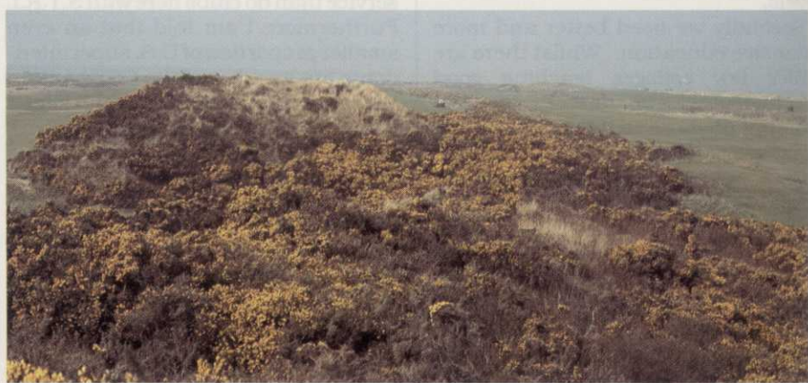
The central dune looking down the proposed 15th (the Golf Course May 1987)