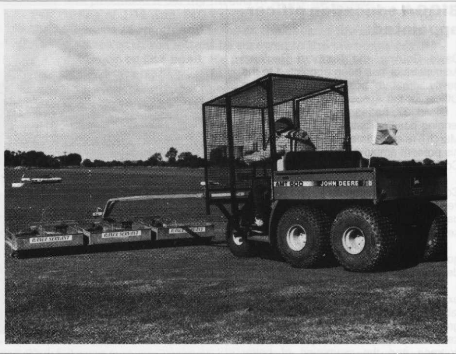
The operators cage means the driving range can be kept open.

Keith Tysoe, Woodlands Agricultural, came up with the AMT 600 as a solution. The modification of adding an operator's cage means balls can be collected any time in complete safety and the range does not have to be closed.