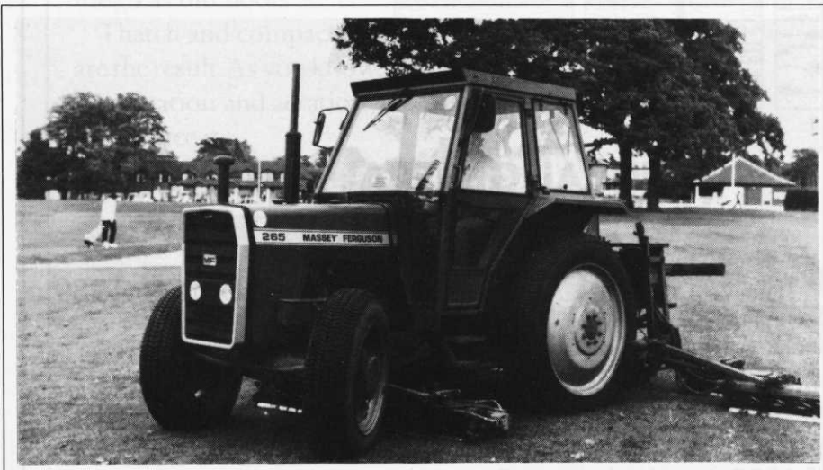
Turf tyres fitted to one of the Belfry's MF tractors.

Viewers of BBC TV's 'Play Better Golf' with Peter Alliss, scheduled to be shown in the Spring will have the opportunity to