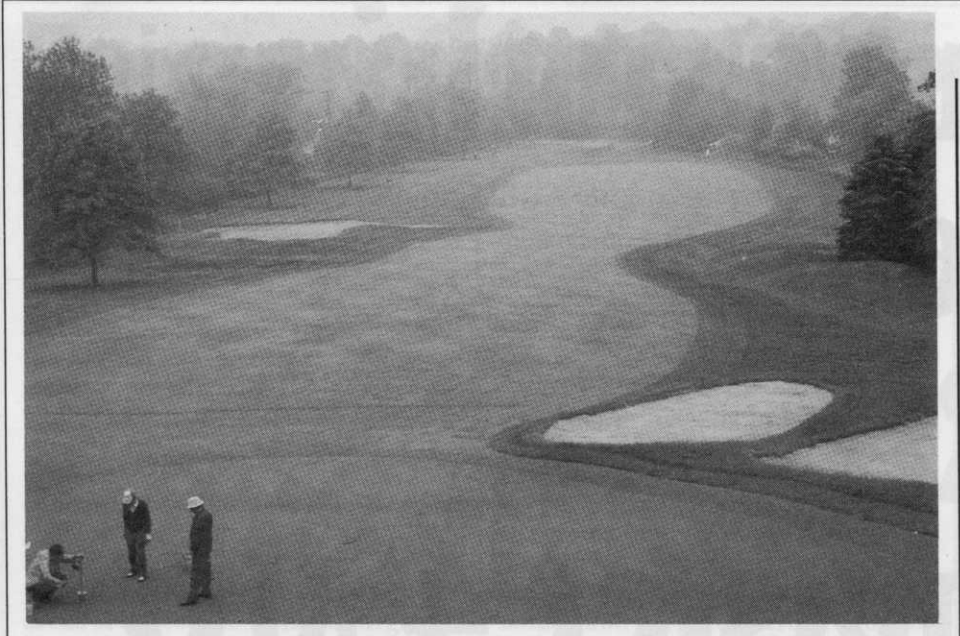
Contour mowed bentgrass fairway

proved maintenance standards and enhanced fairway design can make a course more pleasing and challenging.