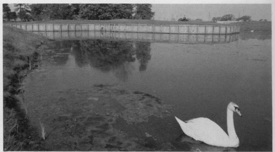
A pair of swans have taken up residence on the lake guarding the 18th island green. Blanket weed encouraged by the hot weather has created a problem, but the owners are taking advice on clearing it

nother so called American influence is the laying out of cart paths throughout the eighteen holes. Although some may believe this is a trend to be discouraged, golf has to be developed along commercial lines if anythging like the necessary new courses are to be built in this country and that means developers must be looking for a maximum return on capital once the operation is underway.