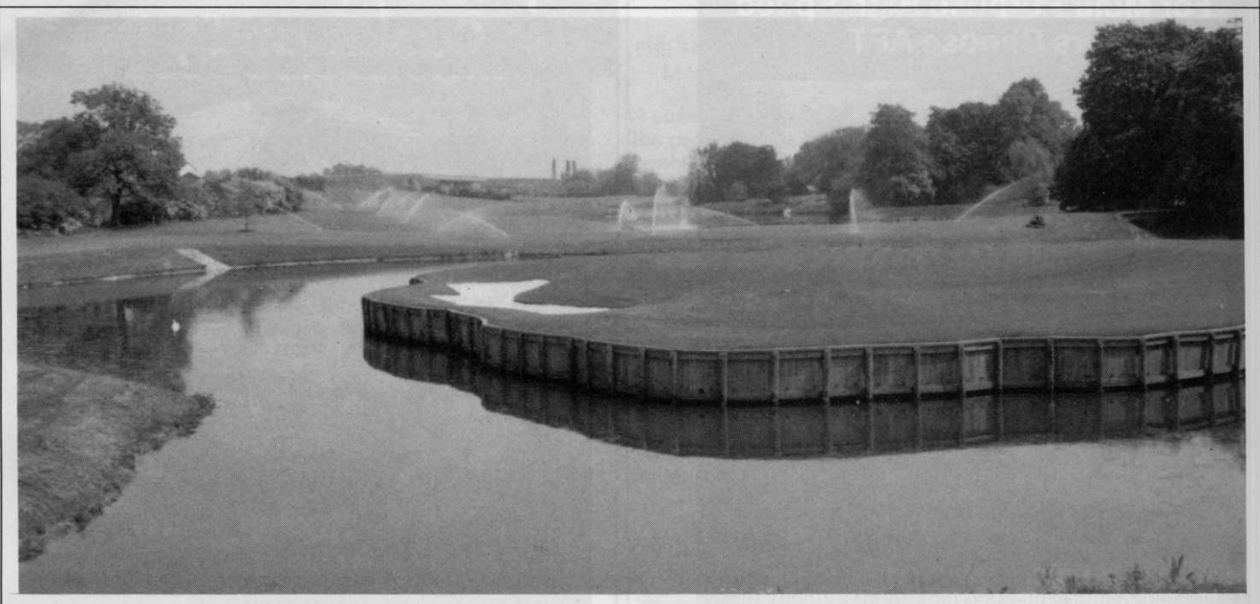
Fairway irrigation keeps the grass growing on the final approach to the 18th green