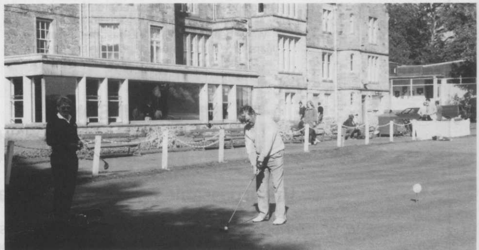
Teeing off at the tournament

buffets and conference luncheons. The evening entertainment included a Scottish Night Out and a Big Band Dance as well as discos and other events. On the final evening trophies and prizes for the golf were presented and this was supported by the 'Taste of Scotland' Banquet and entertainment as the grand finale.