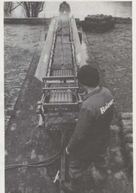
Britain's first automatic turf washer uses water from the river to direct high pressure, high volume jets to remove soil from beneath the Rolawn turves.

Custom grown turf, using special grass varieties and soil types can be produced successfully to customer require-