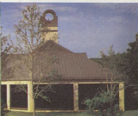
part of First Colony, is the home of the Ladies Golf Club. The club's new Clubhouse and Offices and Hall of Fame. The club's new Clubhouse and Offices and Hall of Fame. The club's new Clubhouse and Offices and Hall of Fame. The club's new Clubhouse and Offices and Hall of Fame. The club's new Clubhouse and Offices and Hall of Fame.