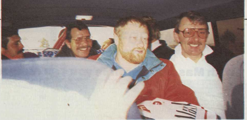
The advance party

Our advance party had arrived early in order to attend specific seminars, and amongst the topics chosen were "Basic Turf-grass Botany and Physiology"