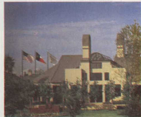
Sweetwater Country Club, located in the heart of the Professional Golf Association

Sweetwater appeared to be one of the less extravagant American creations, with one particularly memorable short hole being sampled - no pars were recorded! Having come to the conclusion that it was time to stop, getting a buggy back to