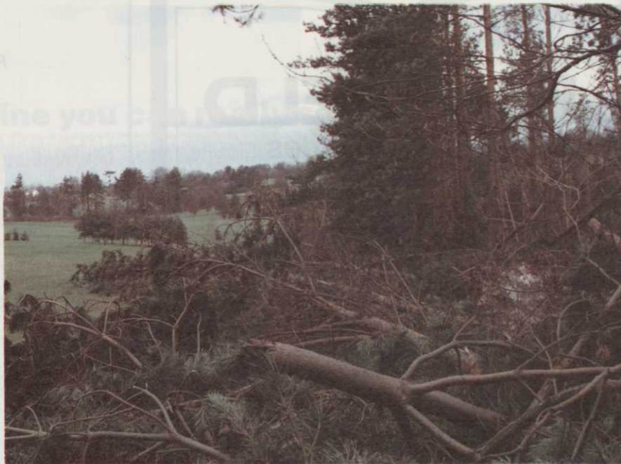
The RAC lost 400 trees during the hurricane force winds last year.

On reflection, after seeing over his operation, I would tend to agree with him!