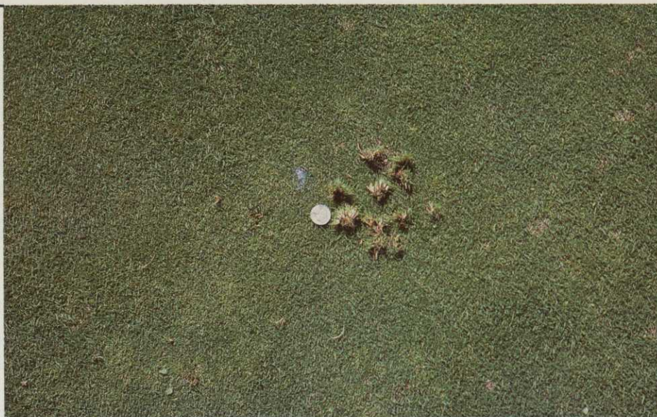
Figure 4: Yellow tuft disease

surface as dry as possible. YELLOW tuft is widespread in the USA and New Zealand, but is as yet very rare here, and consequently not familiar even to experienced greenkeepers. The term yellow tuft has been used for more than 50 years to describe certain symptoms in bentgrasses (Figure 4) for which many possible causes, such as parasite nematodes, a viral infection or a physiological disorder have been suggested. However, research in the 1970's confirmed it to be a disease caused by Sclerophthora macrospora , a member of the downy mildew group of fungi.