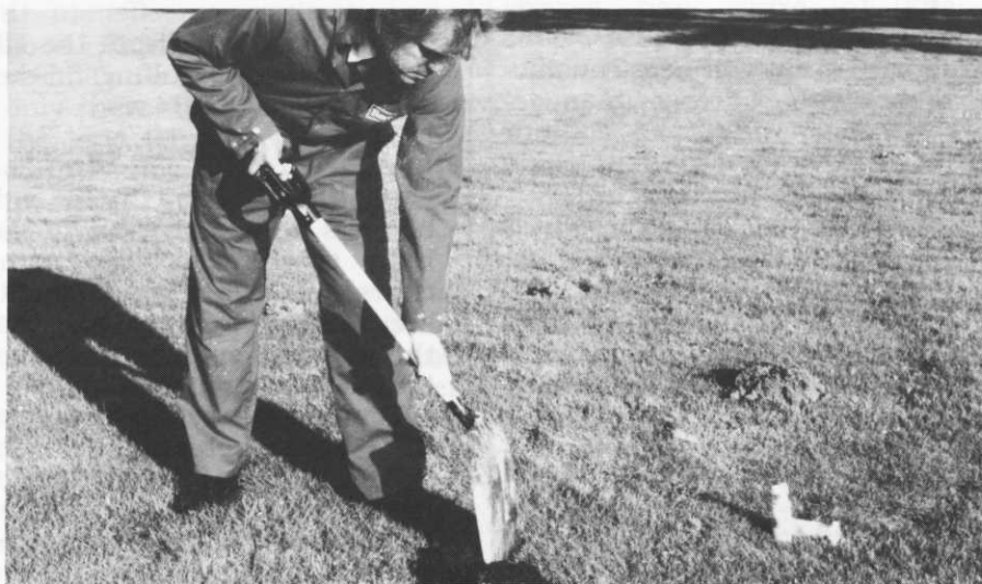
Locating and opening a run before treatment

The greatest problem encountered when attempting to eradicate moles is the risk of reinfestation by neighbouring moles. A vacant mole run is an