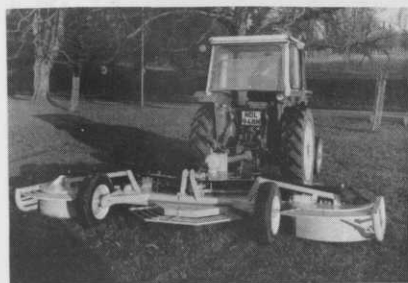
THE FIELDMASTER 150T Professional rotary mower, manufactured by Wessex Farm Machinery, Alton, Hants.

Also on show for the first time is the Scrubmaster 66, a high performance, heavy duty rotary cutter capable of dealing efficiently with the toughest growth. Generating an impact of over one ton at the blade tips the Scrubmaster can easily deal with the heaviest scrub and makes light work of saplings up to 3in. dia.