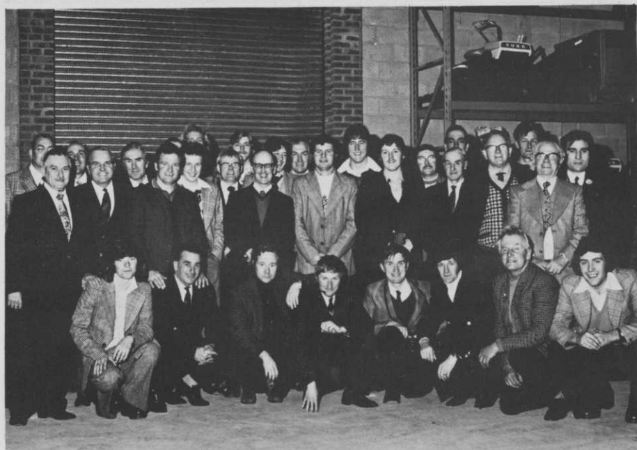
B.G.G.A. Group visits Toro H.Q. Complex