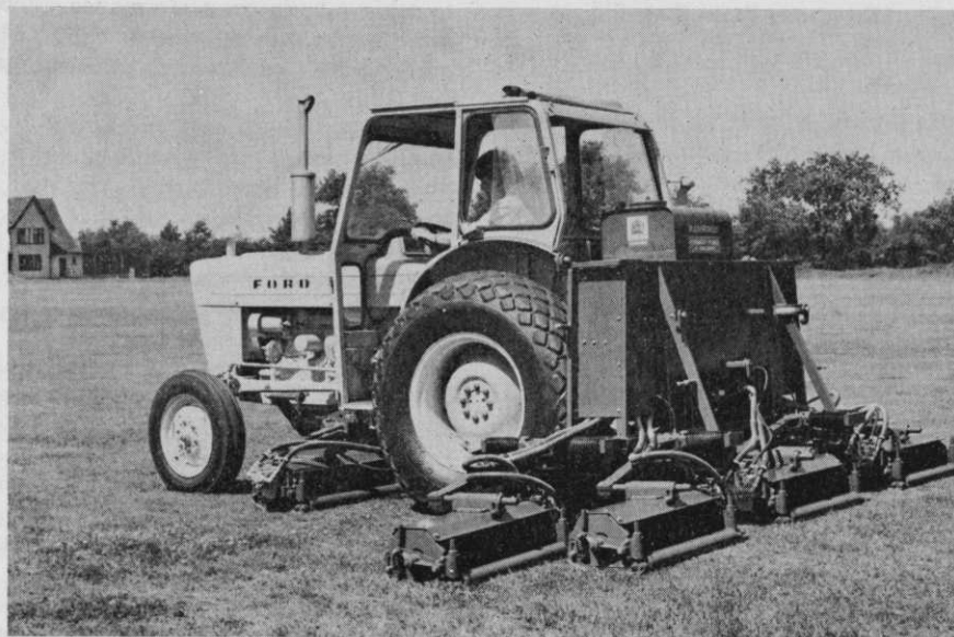
RANSOMES Hydraulic 5/7 Power Gang Mark II—becoming increasingly popular on the golf course.