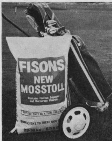
Fisons new moss-killer and fertilizer being applied

replace "Mostoll", which was a mercurised mosskiller based on a traditional lawn sand. Like the rest of the Hi-lites, New Mosstoll is easy to apply and pleasant to handle. It gives long lasting efficient control of mosses in turf, without any danger of scorching. New Mosstoll is approved under The Agricultural Chemicals approval scheme.