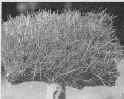
Note dense healthy fine grass sward.