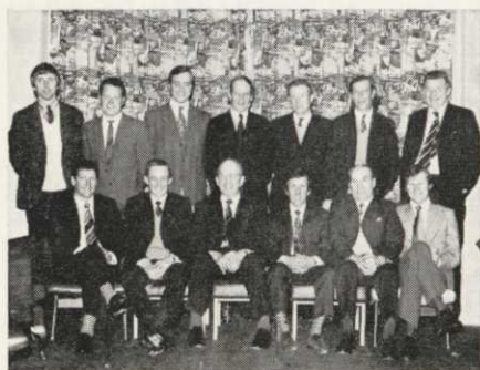
Northern Section Committee

The President's Prize will be held on the 12th June 1974.