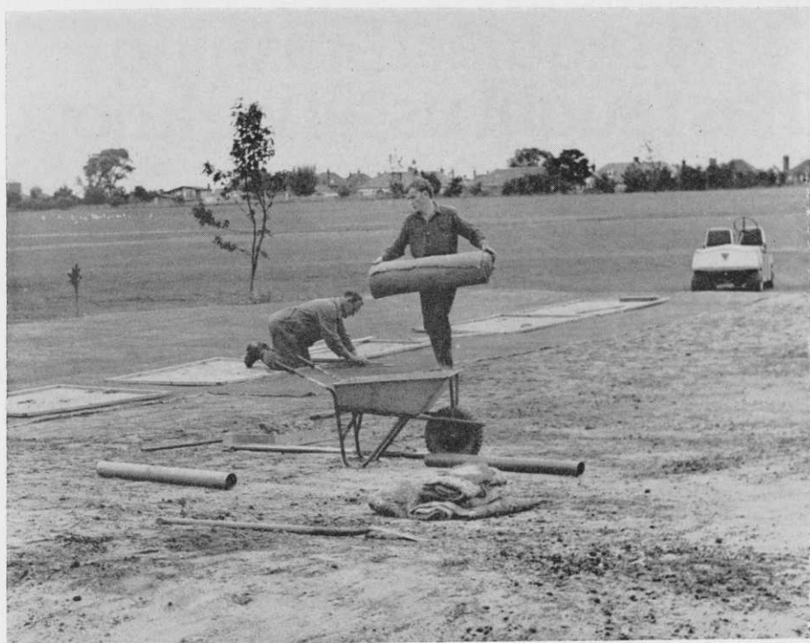
Rolling out the turf at Ganstead Golf Club

surface is considered to be satisfactory.