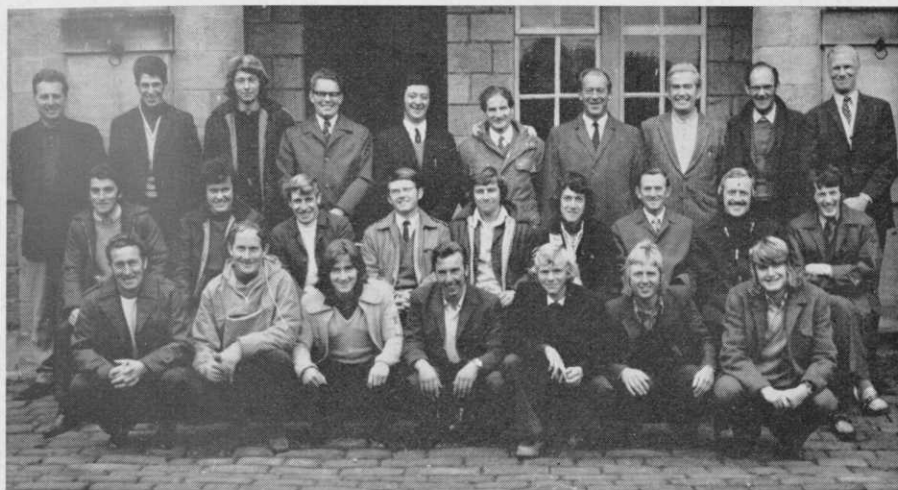
Course of Instruction at Bingley