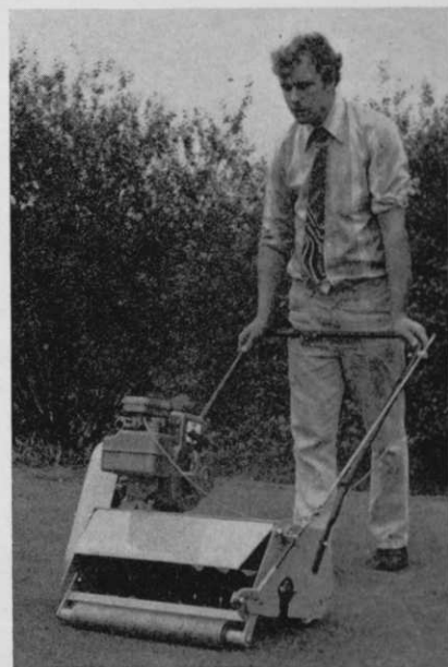
SISIS Equipment (Macclesfield) Ltd., Hulley Road, Macclesfield, Cheshire, SK10 2LZ.

Other Rotorakes in the range are the heavy-duty Auto-Rotorake, priced from £283.15 ex-works (plus VAT) and the Fibamo, 12" model with optional collection box, from £65.00 ex-works (plus VAT).