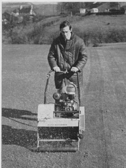
Sisis Auto-Rotorake Mk. II

Scarifiers for the fairways of a much more robust construction are designed to be operated by various tractor units. The most attractive to the greenkeeper will undoubtedly be the mounted variety, 8ft. wide, for use on the hydraulic lift of the tractor. With this width and ease of operation many acres can be treated in a very short time.