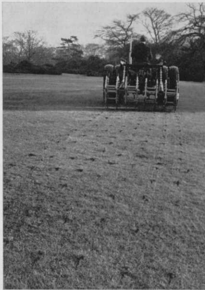
Sisis Heavy Duty Aerator