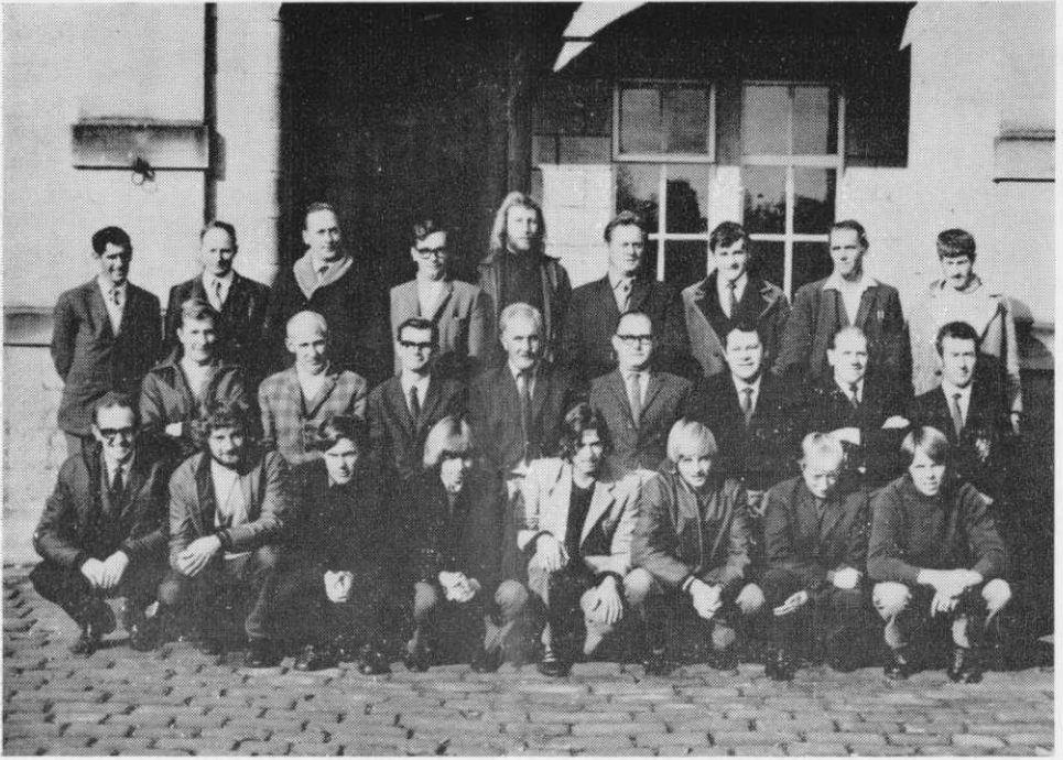
Course of Instruction — 25th - 29th October 1971