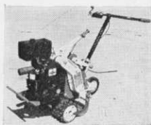
JACOBSEN Sod cutter 12" to 17"