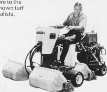
JACOBSEN Greens King 3 gang 70"