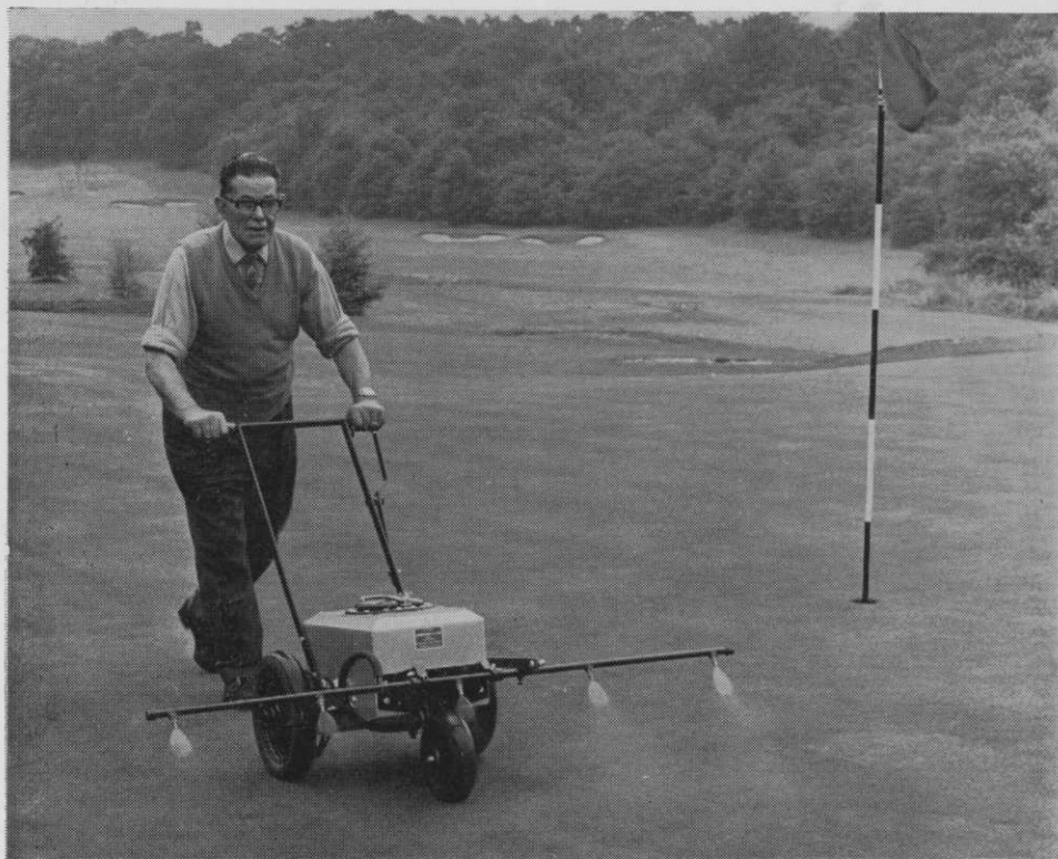
Parker's new sprayer in action. Priced at £52, 10s.