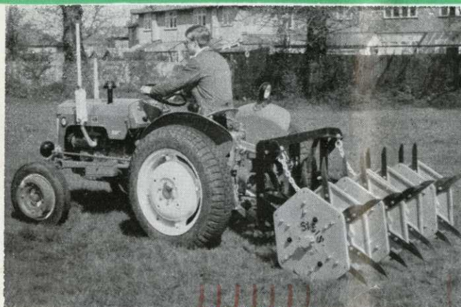
BMC Mini Tractor with "SISIS" 6 ft. Heavy Duty Aerator Ref. HA6. Indicates the power of the lift.