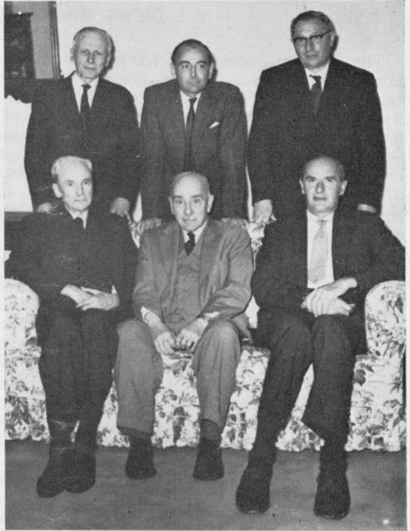
Board of Directors, Sutton & Sons Ltd., Reading.