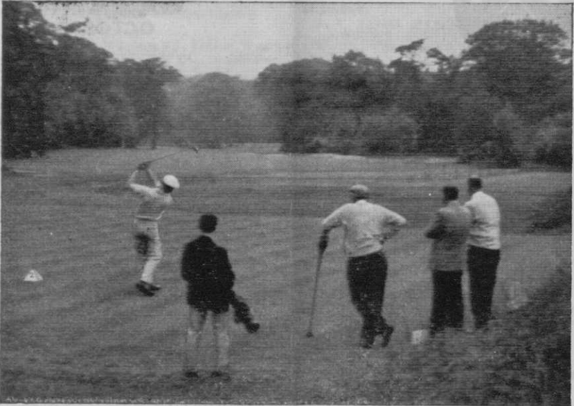
Playing from the 2nd Tee at Dunham Forest, nine months after sowing the grass seed