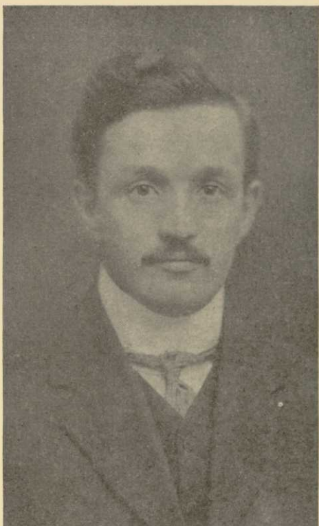
Our founder as he was when the Association was formed in 1912.

All too many Greenkeepers introduce into their work far too much tidiness and symmetry; no two hummocks in a range should be exactly alike, there should be some distinctive change in each, the contour of each hummock