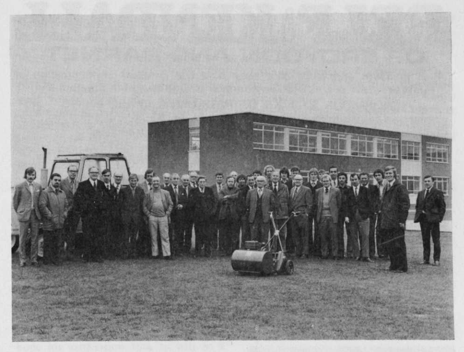
A PARTY of 40 greenkeepers from the North West section of the British Golf Greenkeepers Association, recently visited Ransomes factory at Ipswich. During their visit they watched the production of professional grass machinery in the factory, and saw a demonstration of some of Ransomes high work rate grass cutting and turf maintenance machinery.

9th, Wheatley Golf Club, 9.30 a.m. Autumn Tournament: September 15th, Dore & Totley Golf Club, 1 p.m.