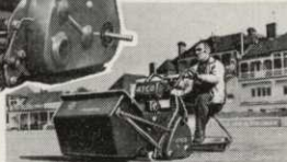
Atco 34" Groundsman

If you want to know more, let us know at the address below and we will arrange for our Distributor in your area to send you a brochure or visit you, whichever you wish. But don't delay. Act now! And remember, Atco's supremacy is based on service!