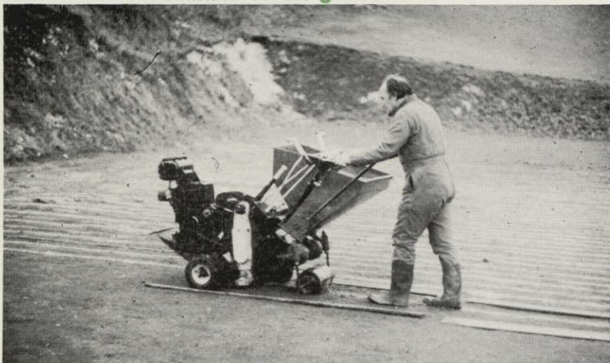
Single Blade Sand Injector operating on a Golf Green

Scientific analysis of your soil enables us to:—