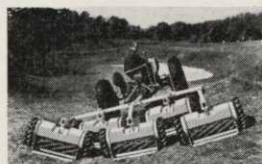
Atco Quintuple Vari-gang mower