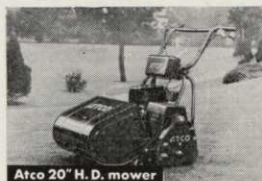
Atco 20" H.D. mower