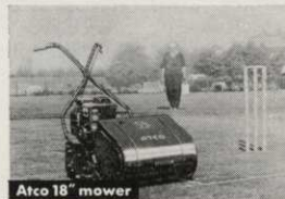
Atco 18" mower

ATCO CHARLES H. PUGH LIMITED ATCO WORKS TILTON ROAD BIRMINGHAM B9 4PR TELEPHONE 021-772 2524-2551-3892