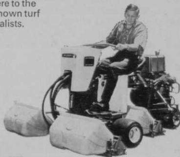
JACOBSEN Greens King 3 gang 70"