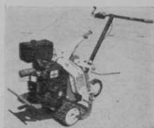
JACOBSEN Sod cutter 12" to 17"